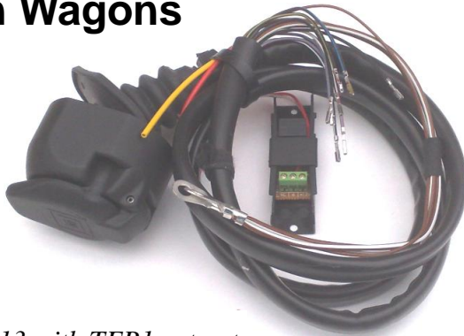
TF120VX13 with TFR1 cut out